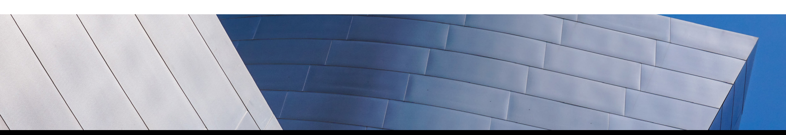
Walker Crips | UK 95% Annual Kick-out Plan | (MS193) 13

In order to withdraw all or part of your investment, we will need to sell the underlying securities of the Plan (or a proportion thereof) which are held by us on your behalf. The amount you will receive back will be determined by the Issuer. During the Investment Term the value of your investment may go up or down. Different factors, such as a fall in the level of the Index, or a rise in interest rates, can have a significant negative impact on the value during the lifetime of the Plan.